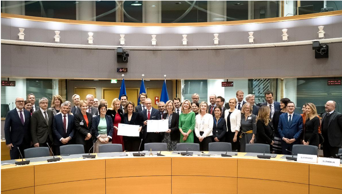
European Wind Charter signing, December 2023

➤ Wind Power Package: 15 immediate actions (permitting, finance, auctions) to strengthen the competitiveness of Europe's wind value chain: