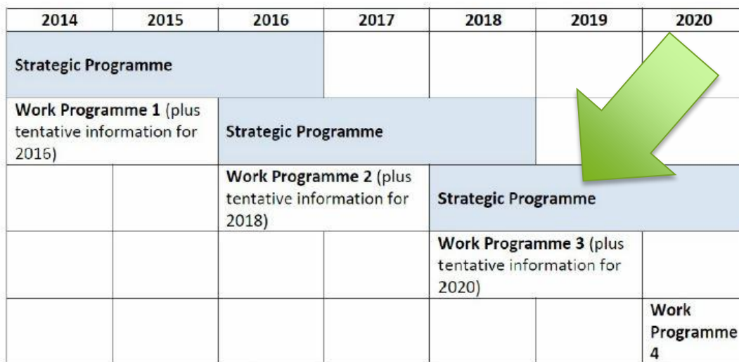
Calendar for adoption of Work Programmes during Horizon 2020

Nearly doubling of non-nuclear energy research funding (from € 3.8bn in FP7 + CIP to € 5.6bn in H2020).