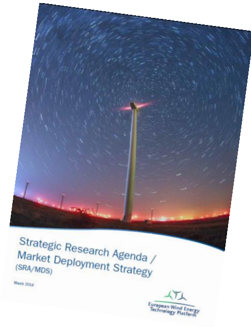
Strategic Research Agenda 2014